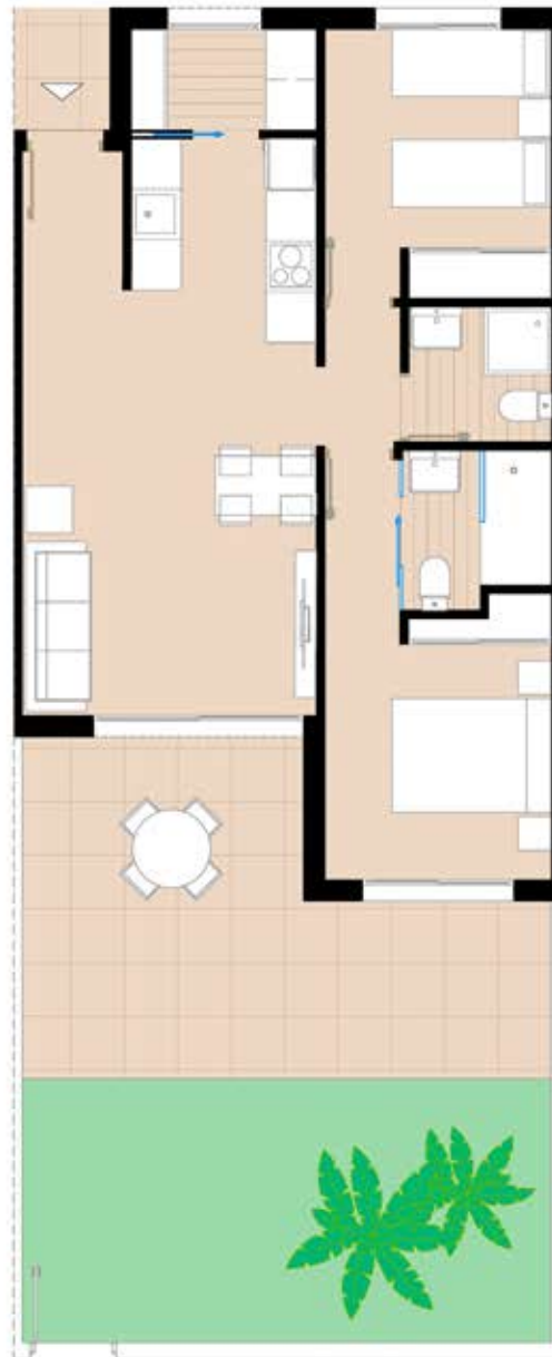
Ground Floor/ Planta Baja (E:1/100)